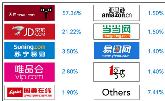
Figure 2 : Main online market places in China, Source: bysoft

The major four drivers for China e-commerce growth, as mentioned by KPMG Partner and Head, Mary Chong (Stanley & Ritacca , 2014), are: e-commerce platforms, social media platforms, digital payment platforms and mobile devices. E-Commerce platforms: Alibaba is the undisputed share leader of China’s e-commerce market of B2C and C2C e-commerce. In fact, by 2016 Alibaba is positive of surpassing Walmart as the number retailed network in the world. It operates in two distinct platforms: Taobao and Tmall (Stanley & Ritacca , 2014).